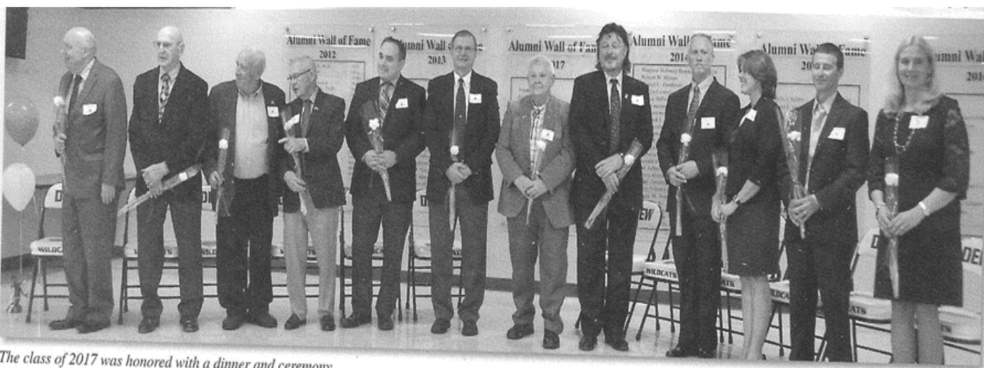
The class of 2017 was honored with a dinner and ceremony.